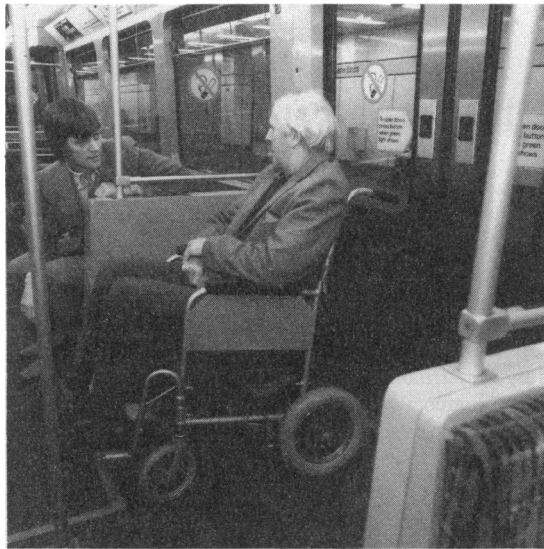
NORTH EAST STUDIOS