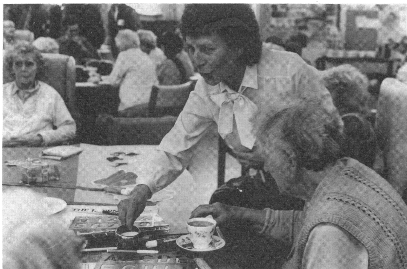
...and day care