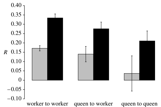
Figure 1. Average relatedness ( R ) of Formica lemami ants on Mull (with standard errors) determined using 12 microsatellite loci. Comparisons are within or between workers and queens within Microdon mutabilis infested (grey) and uninfested (black) colonies. All differences were highly significant (see text).

Individual worker genotypes were used as input for the maximum likelihood program COLONY (Wang 2004) to estimate the number of queens and their mates contributing to the workers, per colony, at each site. Allelic dropout and other errors were assumed to be 5%. As only one sex is able to be designated as multiply mating in the program, we expected queens to be the polygamous sex with males expected to be monogamous. We compared the number of queens, estimated for uninfested and infested colonies, using a generalized linear model with Poisson errors and a logit link implemented in SPLUS v. 7.0. Since the variance is overdispersed, significance was assessed on the deletion of terms using an F -test. Similarly, we compared the average number of mates per queen per colony (see §3). For simplicity, standard errors in text and error bars in the figure are calculated on untransformed data, which makes little practical difference. We did not estimate the genetically effective queen number (Pedersen & Boomsma 1999) as the number of mates per queen was estimated to be high (see §3) and thus the assumption of singly mated queens was invalidated. In any case, comparisons of the R estimates