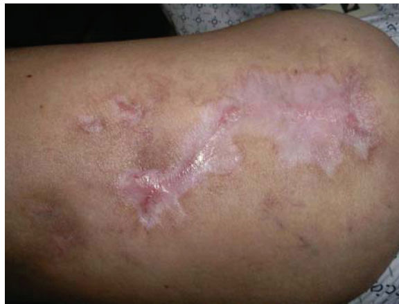
Figure 3. Healed wound. Residual scarring at area of pyoderma gangrenosum resolution.

TNF- \alpha has been shown to enhance neutrophil activation, upregulate the expression of adhesion molecules, and induce the release of chemokines and cytokines from fibroblasts. 13,19 The TNF- \alpha inhibitors infliximab, etanercept, and adalimumab reduce inflammation by binding and inactivating free TNF- \alpha . 20 Infliximab and adalimumab have the additional ability to bind surface-bound TNF- \alpha , with subsequent complement fixation and cell lysis, potentially suppressing T cells and other cells expressing surface TNF. 21