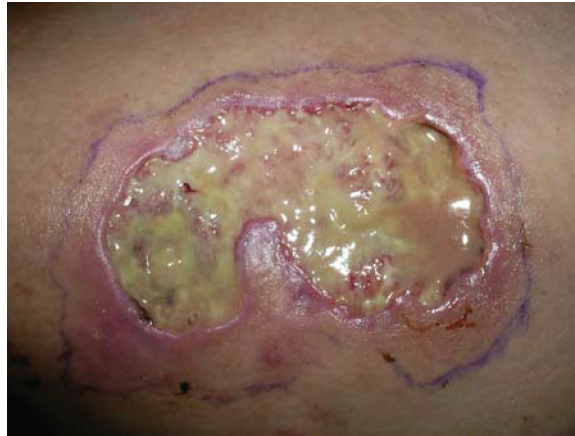
Figure 2. Pyoderma gangrenosum. Large purulent ulcer with violaceous undermined borders.

The regimen of cyclosporine, infliximab, azathioprine, and monthly IVIG initially resulted in improvement of the PG and some re-epithelialization; however, the immunosuppression had to be temporarily withdrawn after the patient was hospitalized for aseptic meningitis. After discharge, the IVIG was restarted, but was then stopped after 2 episodes of intractable nausea following IVIG infusions. Despite reinitiating cyclosporine and infliximab, the ulceration and surrounding inflammation progressed, eventually involving an area 8 cm in diameter on her left thigh (Fig 2). A trial of sulfasalazine 2000 mg (or 2 grams) per day was ineffective as well. Given that her PG was not responding to multiple immunosuppressive medications, prednisone 20 mg daily was initiated in consultation with ophthalmology. Higher doses of prednisone were attempted, but the patient again developed symptoms of pseudotumor cerebri. Because of the patient's persistent headaches and visual changes, the prednisone was tapered.