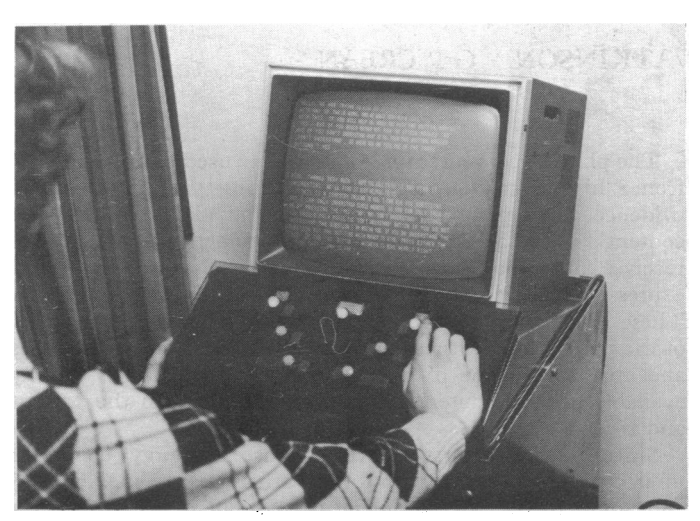
FIG 1—A patient being questioned by the computer.

Fig 1 shows a patient using the computer interrogation system.