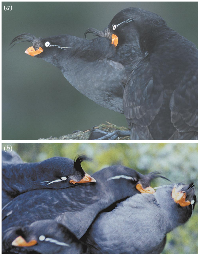
Figure 1. Stereotyped 'ruff sniff' courtship. Individuals place their bills within the nape feathers of a display partner, a region of the body that is strongly scented. (a) Display between a courting pair. (b) Group display.

observations suggest that both are seasonal. In a captive colony, 'ruff sniff' behaviours are absent during non-breeding (S. Devereaux, personal communication). Also, a detailed description of both live and dead birds, collected following an unusual mid-winter encounter at sea (Dick & Donaldson 1978), fails to mention scent, suggesting that odour may have been mild or lacking altogether. Finally, to human observers, odours of both wild and captive crested auklets wane at the end of the breeding season, coincident with moult and the loss of other ornaments (crests, orange beak plates; J. C. Hagelin, unpublished data).