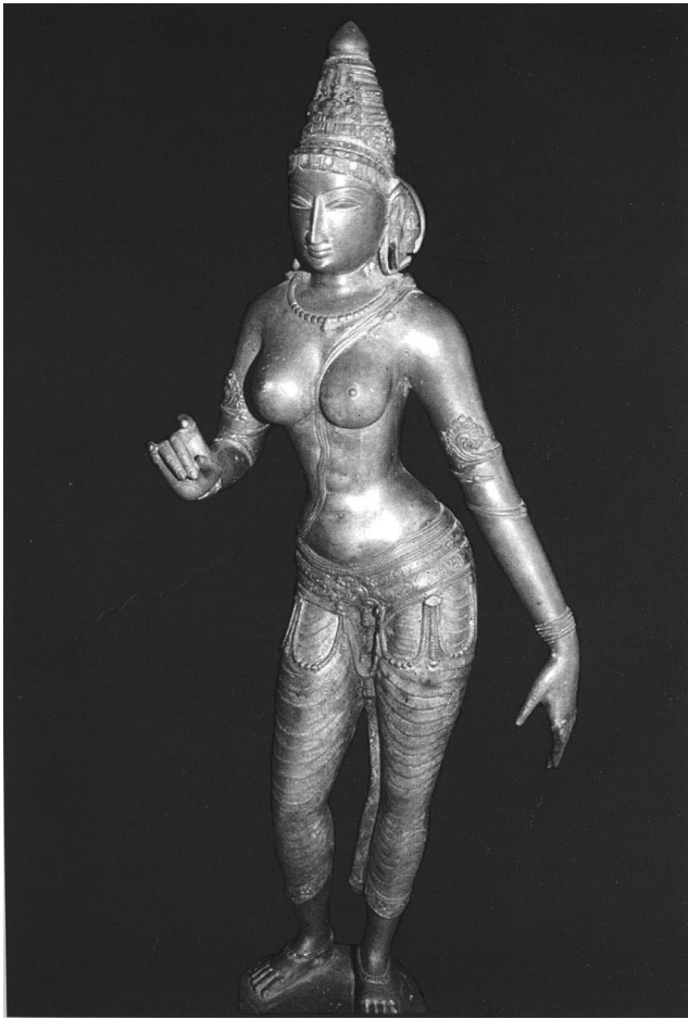
Figure 2. A Chola period ( ca. eleventh century) statue of the Goddess Parvathi. (The statue is in the Ramachandran collection; the picture is reproduced from the Journal of Consciousness Studies 6, 1999, with permission from Imprint Academic.)

more vigorously at a stick with three red stripes than they will at the stick with the red spot. Ramachandran argues that three red stripes is a caricature of a red spot to seagull chicks. This example shows that a caricature need not be easy to detect consciously. The inference that for seagull chicks the red stripes are a caricature of a red spot is based on an assumption that the chicks have no reason to be hungrily pecking at anything other than their mothers' beaks. The situation with people is considerably more complex. Purely abstract, geometrical pictures could well be caricatures for anything we find attractive in the real world. This offers possibilities for exploring the connections between the human visual and limbic systems by, in part, exploring abstract art. This exploration might involve, for example, checking for similar brain reactions to some real world referents and some pure abstractions.