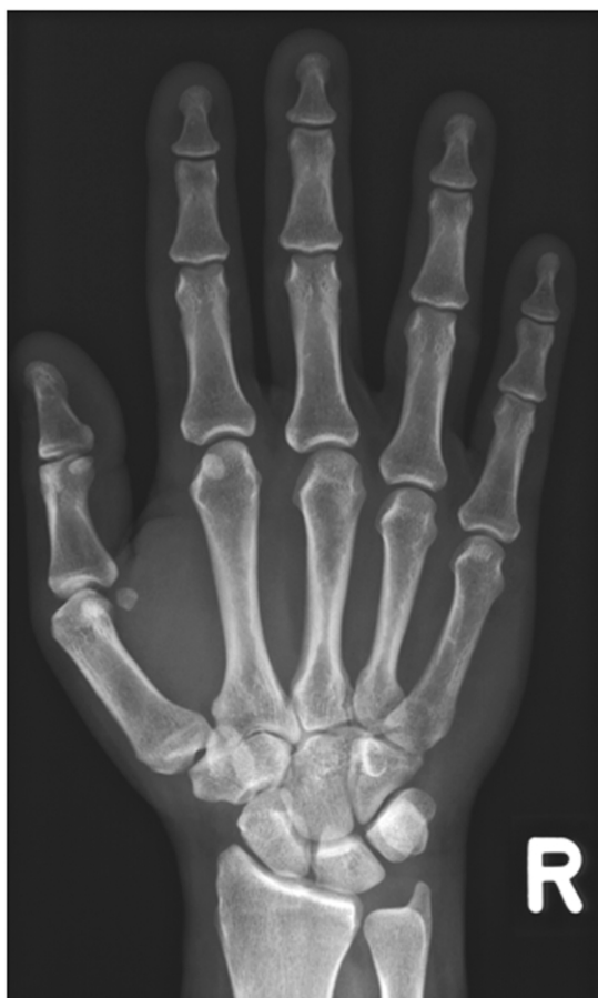
Figure 2. X-ray of the right hand of affected individual II-8, showing no skeletal alteration or any degenerative or inflammable joint process.

to a frameshift and premature truncation of the corresponding protein (c.92_93insG, p.Leu31fs) (GenBank accession number NP_001025042). Sixty healthy German controls tested by Bgl I restriction enzyme analysis were negative for this change, further corroborating its pathogenicity. On the paternal allele, the nonconservative missense mutation c.218G→A, which leads to an amino acid exchange from cysteine to tyrosine at position 73 (p.Cys73Tyr), was identified. The affected residue is highly conserved in evolution, was not found among 300 German white control chromosomes tested by Hpy CH4III restriction enzyme analysis and, thus, is thought to be pathogenic too.