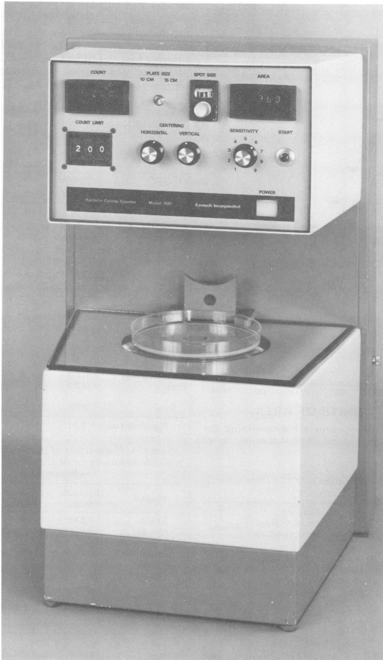
FIG. 2. Model 500, Exotech laser beam electronic colony counter.

and SPLPC. Tables 3 and 4 show a similar analysis of 61 homogenized milk samples, and Tables 5 and 6 show the analysis of 28 chocolate and skim milk samples. As expected, the mean recoveries of bacteria per milliliter differed significantly from sample to sample, and there