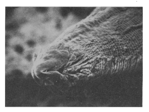
FIG. 3.—Anterior extremity of T. canis larva (x 5,250). The cuticular mouth parts are visible (scanning electron micrograph).

these animals. Very little information on this could be found, and one had to go back to 1927 for any recorded survey of T. canis incidence in dogs in Britain. Lewis (1927) then found 16\cdot3\% of 43 dogs in Aberystwyth to be infected. Brown and Stammers (1922) had found that 3% of dog faeces recovered from London streets contained T. canis ova.