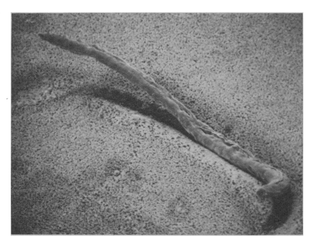
FIG. 1.— T. canis larva photographed (x 420) with Cambridge Instrument Company's scanning electron microscope.

The boy who was our first toxocaral patient had not been out of Britain, and this therefore posed the question of how common the infection is among dogs and cats in this country and what are the chances of man becoming infected from