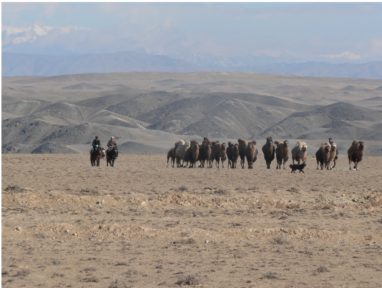
Figure 1 Khazak herdsmen, Xinjiang Uygur Autonomous Region.

ing rates in 2003–2004. Chi-square tests were used to compare the breastfeeding rates in the two periods of time.