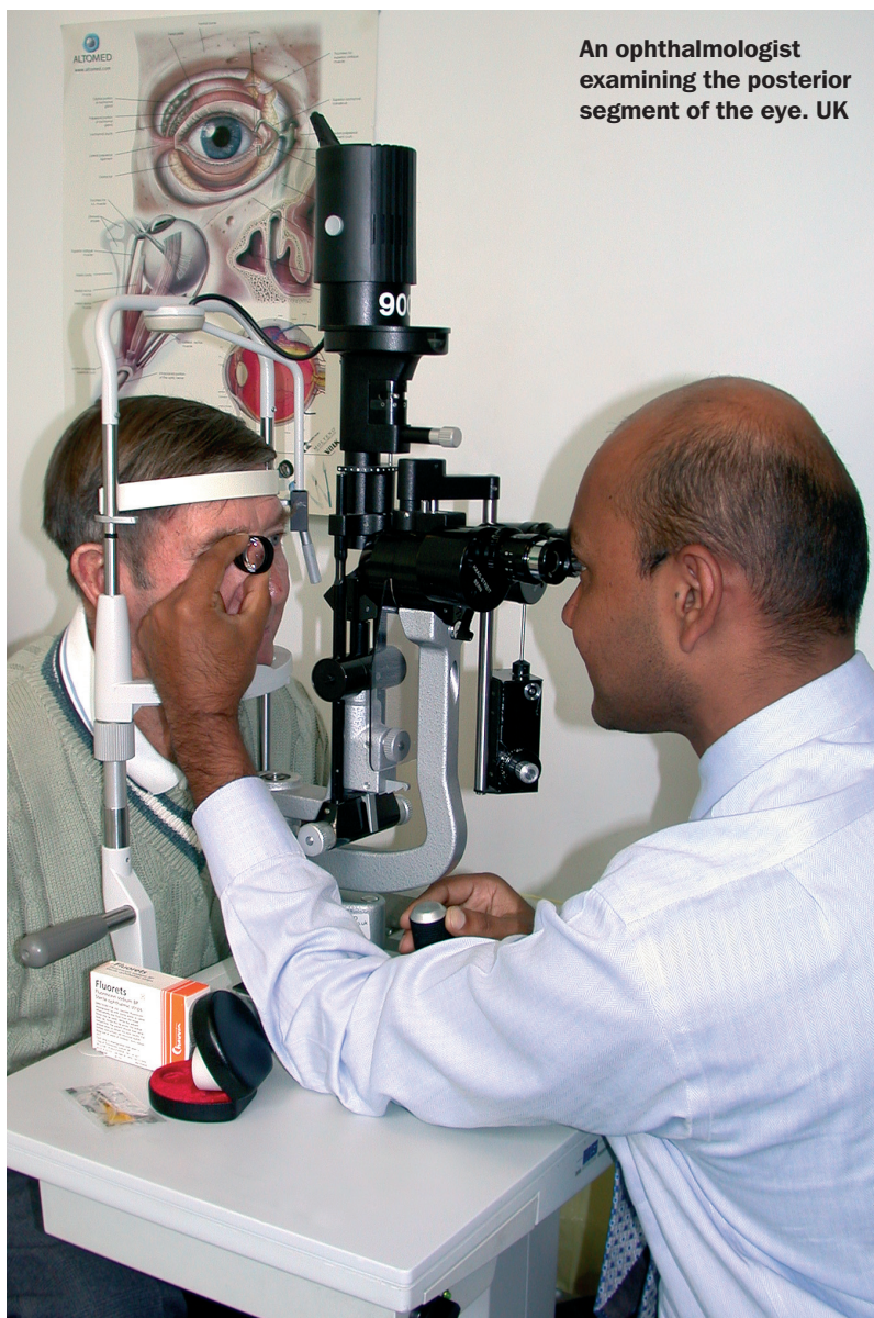
An ophthalmologist examining the posterior segment of the eye. UK