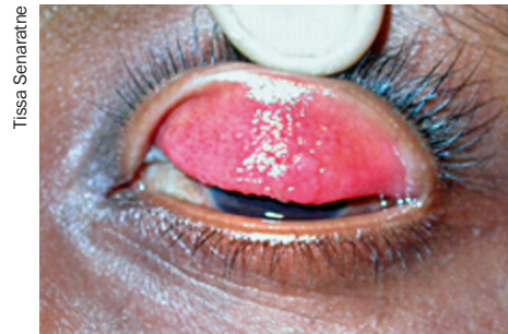
Fig 5. Eversion of the upper tarsus shows marked conjunctival papillae in vernal keratoconjunctivitis

The cause of vernal keratoconjunctivitis is not known, but it is often associated with asthma or eczema and is probably due to a longstanding allergic reaction. The condition usually starts between the ages of three and 25 years, and the patient complains of chronic itching, a thick, clear, stringy discharge, light