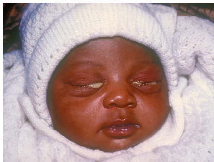
Fig. 2. Baby suffering from conjunctivitis due to Gonococcus

Treatment of babies: Clean the eyelids, and show the mother how to do this. Gently open the eyes, and instill tetracycline eye ointment, or other antibiotic eye ointment, showing the mother how to do this. Make sure she can instill the ointment, give her a tube of tetracycline (or other antibiotic), and tell her to put it in both eyes every hour. Tell the mother that this is a very serious infection, and that she and her baby should go urgently to an eye department as she and her baby need an injection of antibiotic.