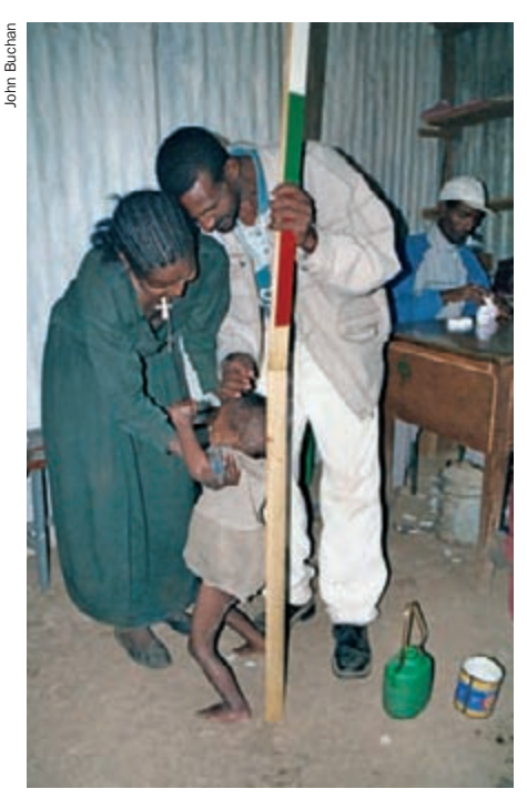
Height-based azithromycin dosing. ETHIOPIA

In most trachoma-endemic areas, there are insufficient trained medical and nursing personnel. A pilot study in Ghana showed that trained community health volunteers could safely manage and dispense azithromycin to both children and adults. 11 This cadre now routinely assists in antibiotic distribution throughout National Trachoma Control Programme intervention areas in Ghana. Literate volunteers from trachomaendemic populations also give useful assistance in a few other countries: cooperation with other community-based disease control programs should be considered.