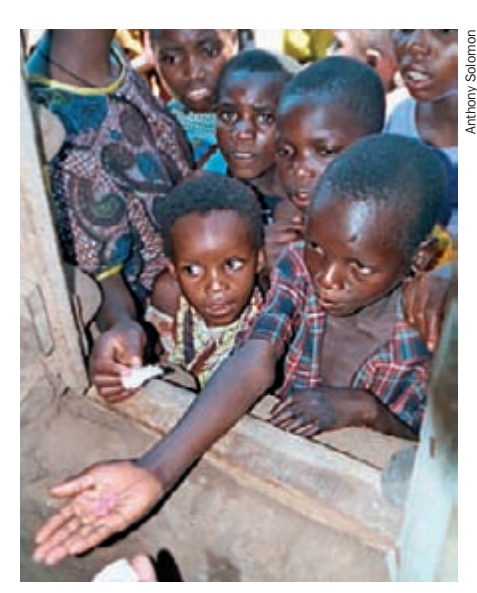
Azithromycin tablets in the hand of a child. ΤΔΝΖΔΝΙΔ

For trachoma control purposes, the recommended dose of azithromycin is one dose of 20mg of medicine per kilogram body weight, to a maximum of 1g. However, weighing scales are expensive to buy, bulky and heavy to transport, and are sometimes unreliable in the field. Heightbased azithromycin dosing<sup>11 12 13</sup> is now accepted as an economical, safe, effective and convenient alternative. Since the relationship between height and weight varies from one population to the next, programme managers should not use generic height-based dosing scales, but rather ensure that the scale used is appropriate for the specific recipient population.