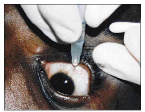
Fig.1: The injection is given 4mm posterior to the limbus

It has been considered that the rate of CMVR is lower in Africa than in the United States, possibly related to the fact that, lacking effective therapy, patients in Africa may not live long enough to develop the very low CD4 cell counts (<50/cu.mm) that are associated with the development of CMV disease. 1.2 Over the last 4 years we have, however, witnessed a steady increase in the number of patients presenting to our clinic with CMVR. This increase may be