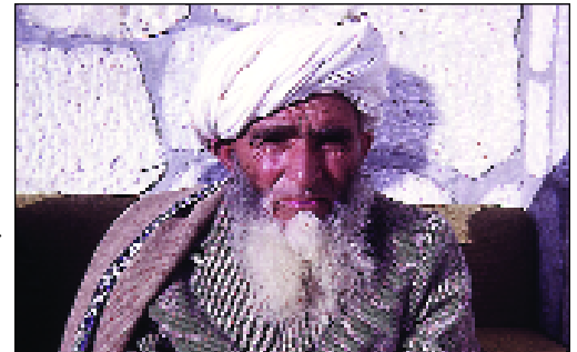
Age-related cataract – the most common cause of blindness in the world

We developed a manual ‘tally’ (record) sheet system and two computerised packages. The computer systems use more input data and provide a more detailed analysis. It is important to select the method that is most suitable and usable on a regular and long term basis in your own situation. When skilled data entry operators are not