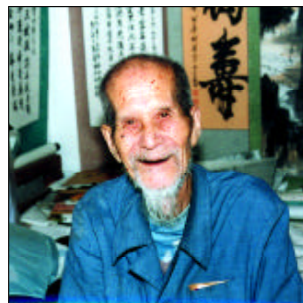
Vision 2020: The Right to Sight – for all ages. This lively 95-year-old Chinese calligrapher had early bilateral cataract

It is also becoming evident, however, that much more attention must be given to improving visual acuity outcomes among those who have had cataract surgery. Recent population-based surveys in several countries have shown that 40–75% of post-operative eyes have a presenting visual acuity worse than 6/18, with as many as 50% worse than 6/60. 3–6 This high proportion of cataract-operated cases with poor vision is a matter of great concern. Many cataract patients are not experiencing the level of vision restoration possible with modern day surgery. A clinical trial of cataract surgery at the Aravind Eye Hospital in India suggests that four years after surgery no more than 25% should have presenting visual acuity worse than 6/18; and with best corrected vision, no more than 5% should be in this category. It might be expected that cases operated on in recent years are faring better than earlier cases. This is generally not the case, however, as was shown in the