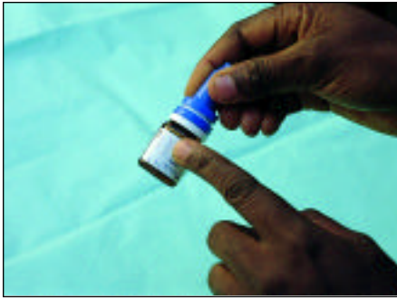
Expiry dates on drop bottles must be checked