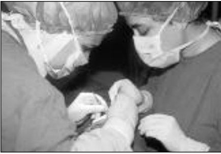
The correct wearing of caps, masks and gloves is important for control of infection