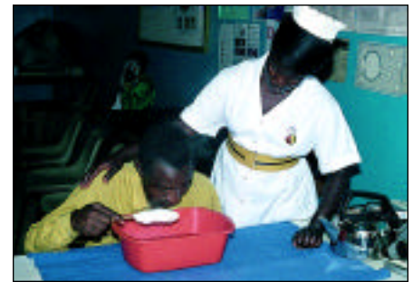
Good personal hygiene and clean uniforms are important for prevention of infection