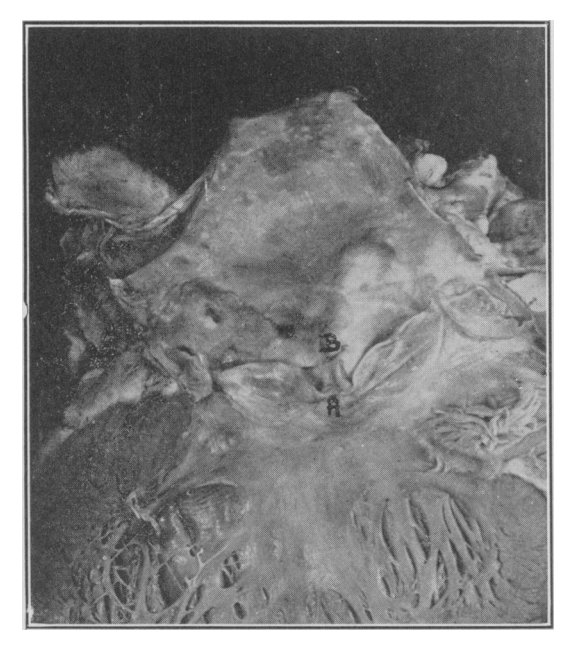
FIG. 2.—Rupture of the Aortic Valve. A—rupture of valve. B—tear in aorta. (Montreal General Hospital A-25-1.)