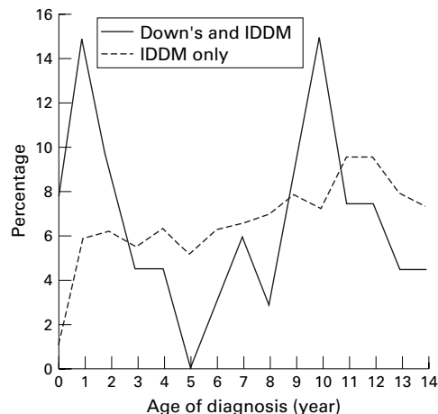
Figure 1 Variations in age of onset of insulin dependent diabetes mellitus (IDDM) between children with Down's syndrome and the 1988 British Paediatric Surveillance Unit survey.

Those who developed IDDM did so at a median age of 9 years. The age of onset of children under 15 who developed IDDM was compared with the 1988 BPSU national study of diabetes in children under 15 years ( n = 1600 cases). Children with Down's syndrome were diagnosed with IDDM significantly earlier than the general population (mean age, 6.7 v 8.0 years; p = 0.02 ). The distribution of age at diagnosis was also different between the two datasets (Kolmogorov-Smirnov, p = 0.04 ). A significantly higher pro-