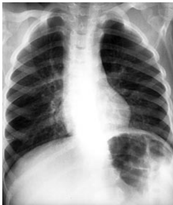
Figure 4 Frontal chest radiograph, age 3.5 years. There is no radiographic suggestion of bronchiectasis.