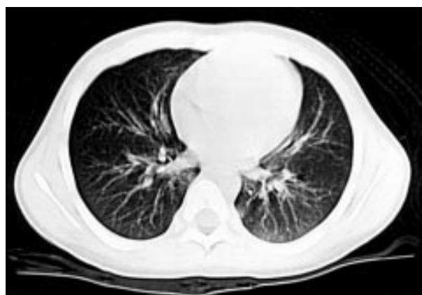
Figure 3 HRCT performed six months after surgery for gastro-oesophageal reflux (age 3 years). This section HRCT image at the same level as fig 2 shows notable interval improvement with minimal residual bronchiectatic changes in the right middle lobe.