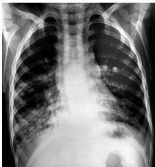
Figure 1 Frontal chest radiograph, age 2.5 years. There are bibasilar reticulonodular opacities. The heart borders are obscured, suggesting opacification in the right middle lobe and lingula.

months of age. He had persistent central and peripheral type wheezing and digital clubbing. A modified barium swallow revealed mild dysfunction of the oral phase of swallowing. A nuclear scintiscan revealed eight episodes of gastro-oesophageal reflux. Chest radiograph revealed bibasilar reticulonodular opacities with new right middle lobe disease (fig 1). High resolution computed tomography