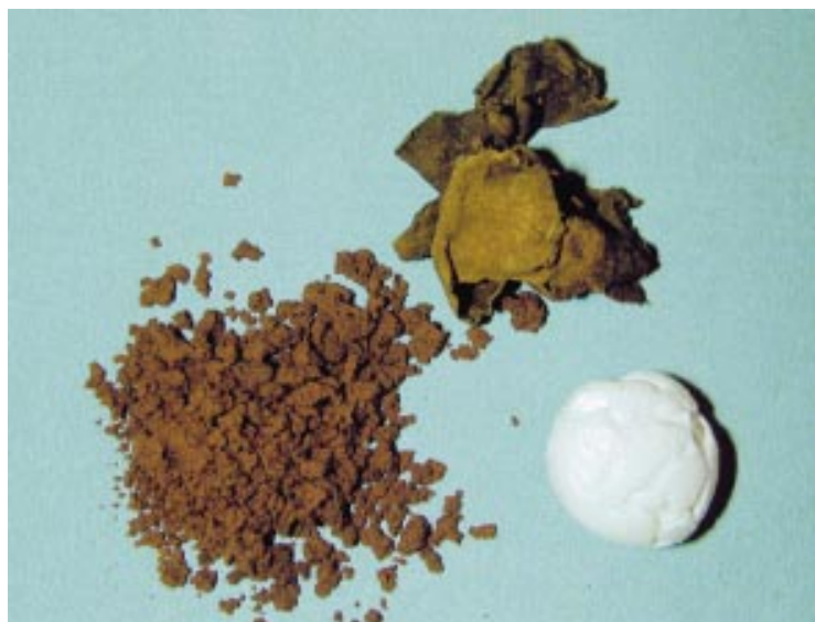
Figure 2 Photograph of ingredients of the paste.

leaves, lime, and freeze dried coffee mixed with water (figs 1, 2 3 ).