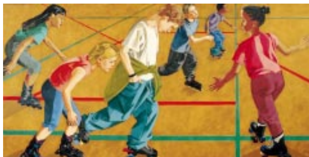
Figure 1 Cover of Archives, June 2001.