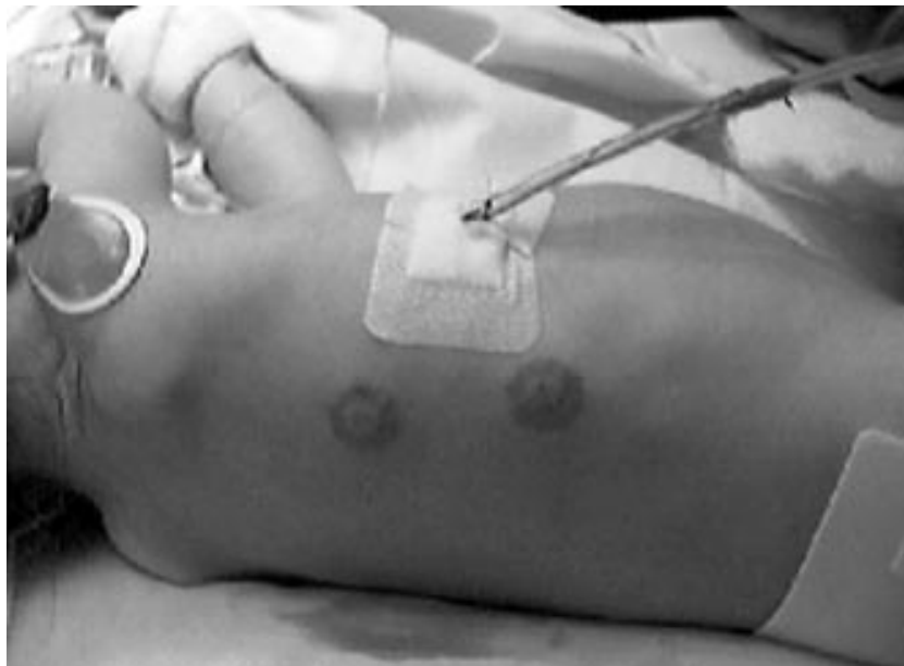
Figure 1 Surgical scars: VATS.

In this issue, Satish et al describe the outcome in 14 children treated with chest drain only. 13 Chest tube drainage occurred for eight days with a median hospital stay of 14 days (maximum stay 28 days). No patient needed a further surgical intervention. We have recently reviewed our experience with 21 children undergoing primary VATS compared to 54 treated with chest drainage alone. 14 All patients had at least stage II empyema. We showed a significant reduction in days in hospital (7.4 versus 15.4) and chest tube drainage (4.0 versus