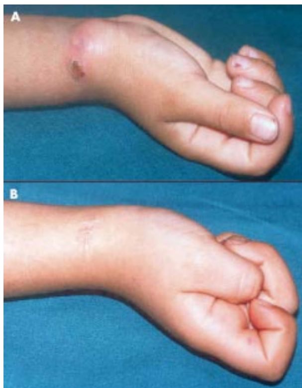
Figure 1 (A) Swelling at the right wrist contiguous to a healing scar from recent wound repair. (B) Complete wound healing and disappearance of the mass at the right wrist.

Clinical and Doppler ultrasound reassessment after 72 hours showed a decrease in size of the PA and a thrombus formation. Repeat compression bandage was checked weekly until complete healing eventually occurred after three weeks (fig 1B). At two years follow up the girl remains symptom free, with normal growth and function of both hands.