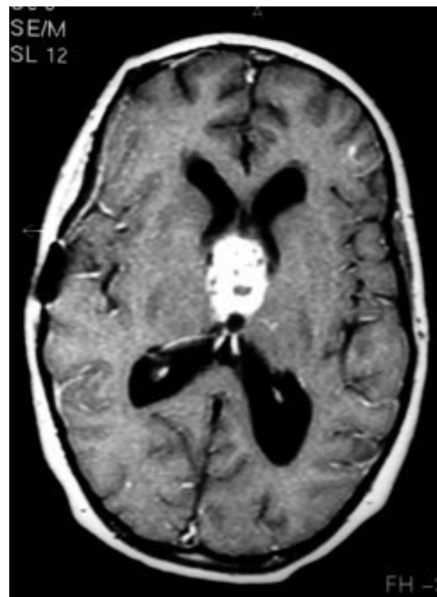
Figure 2 Hypothalamic pilocytic astrocytoma.