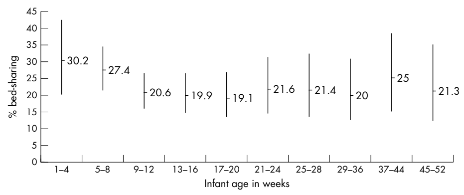
N for each age range: 63, 175, 223, 176, 131, 88, 70, 39, 31, 31, 21, 24, 23

Figure 1 shows a breakdown of bed-sharing on a particular night by age in the national study. The decrease in bed-sharing observed in table 2 from birth to 3 months is clearly evident; however there is no further decrease after this period. At 9–12 weeks 21% of infants were bed-sharing for at