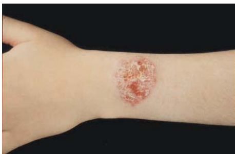
Figure 4 Crusted plaque on the forearm of a young boy from Algeria ( L. major ).

Pentavalent antimonials are an effective treatment in the majority of cases by L. tropica and seem to have few side