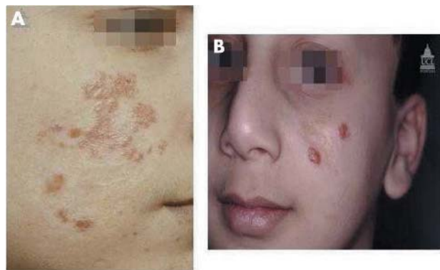
Figure 3 (A) Lupoid leishmaniasis with scarring due to previous L tropica infection and the presence of red/brown papules at the periphery of the scar. (B) Lupoid leishmaniasis with scarring due to previous L tropica infection, and two red/brown nodules at the superior and inferior poles, of the scar on the left cheek of a 9 year old boy from Afghanistan.