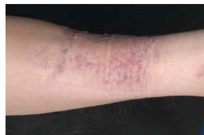
Figure 2 Complete clearing of lesions following local and systemic treatment with tacrolimus.

first reports of successful treatment of a child with pyoderma gangrenosum using tacrolimus.