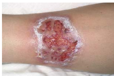
Figure 1 First presentation: ulceration at the lower leg due to pyoderma gangrenosum.

inflammatory bowel disease and pyoderma gangrenosum. Treatment depends on severity, extent, and chronicity of the skin lesions, and on previous treatment. Local treatment with corticosteroids or tacrolimus is adequate for non-chronic small lesions. In case of severe lesions, systemic treatment with tacrolimus, corticosteroids, cyclosporine A, methotrexate, or infliximab is required. In general, an initial response is seen within days to weeks, but complete remission may require months to years of treatment. This is one of the