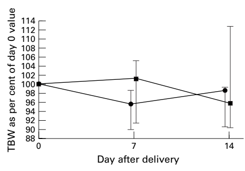
Figure 1 Total body water as a percentage of value at birth: squares denote early group; circles denote delayed group.