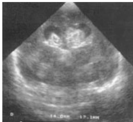
Figure 1 Cranial ultrasound (coronal view) showing enlarged ballooned ventricles (black) with blood clot (white) in the lumina. The ventricular width is measured from the midline to the lateral border.

Posthaemorrhagic ventricular dilatation (PHVD) precedes hydrocephalus but may be self limiting and is widely defined as IVH followed by progressive enlargement until the ventricular width at the intraventricular foramen exceeds 4 mm over the 97th centile for gestational age 1 (fig 1). Infants who fulfil these criteria have a serious prognosis, with about 50–60% being shunt dependent, over 60% disabled, and around 20% dying. 2,3 Hydrocephalus usually refers to infants with progressive enlargement of the head and the ventricular system.