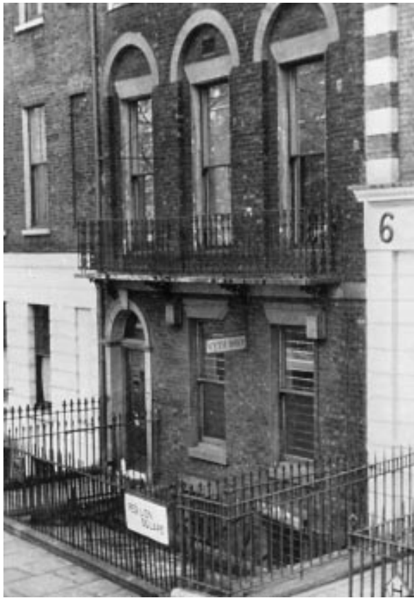
Figure 3 The Dispensary for the Infant Poor, 7 Red Lion Square, London, 1769.

infant's. When infants had to be fed by hand, he argued a preference for a boat or spoon, rather than a horn. Clothing should be loose with as few pins as possible. The importance of good hygiene was emphasised as was the need for sleep, exercise, and stimulation.