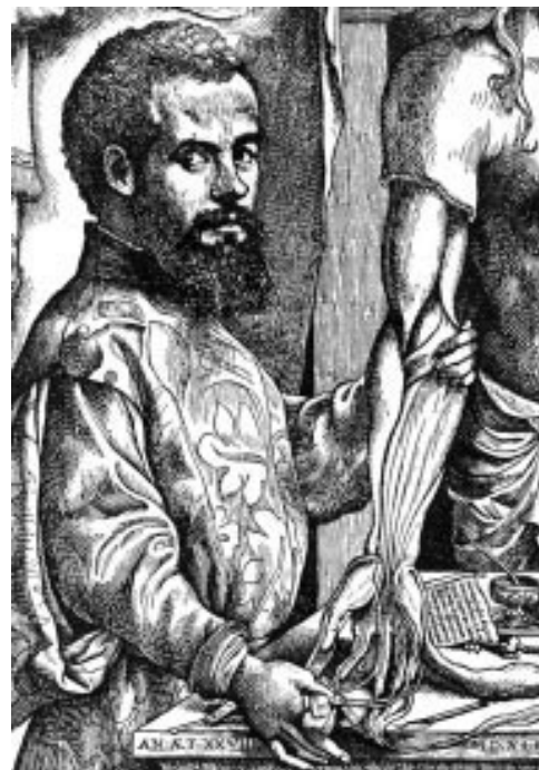
Figure 1 Andreas Vesalius, 1514–1564.