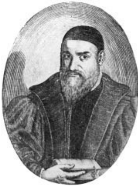
Figure 2 Gabriele Fallopius, 1523–1562.

with murder by the Inquisition, because, on undertaking a postmortem examination of a nobleman who had first died, the heart was found to be still beating feebly. Fortunately the King intervened and commuted the sentence to a pilgrimage to the Holy Land. While in Jerusalem, he heard of Fallopius' death together with an offer to accept again the professorship