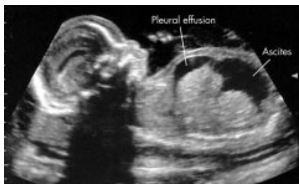
Figure 1 Scan at 23 weeks gestation.

It seemed clear that mother and son had the same dominantly inherited and relatively benign problem of intrauterine ascites, possibly associated with the mother's