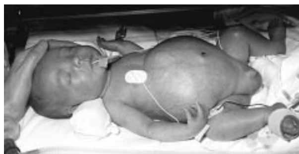
Figure 2 Photograph of baby soon after birth.