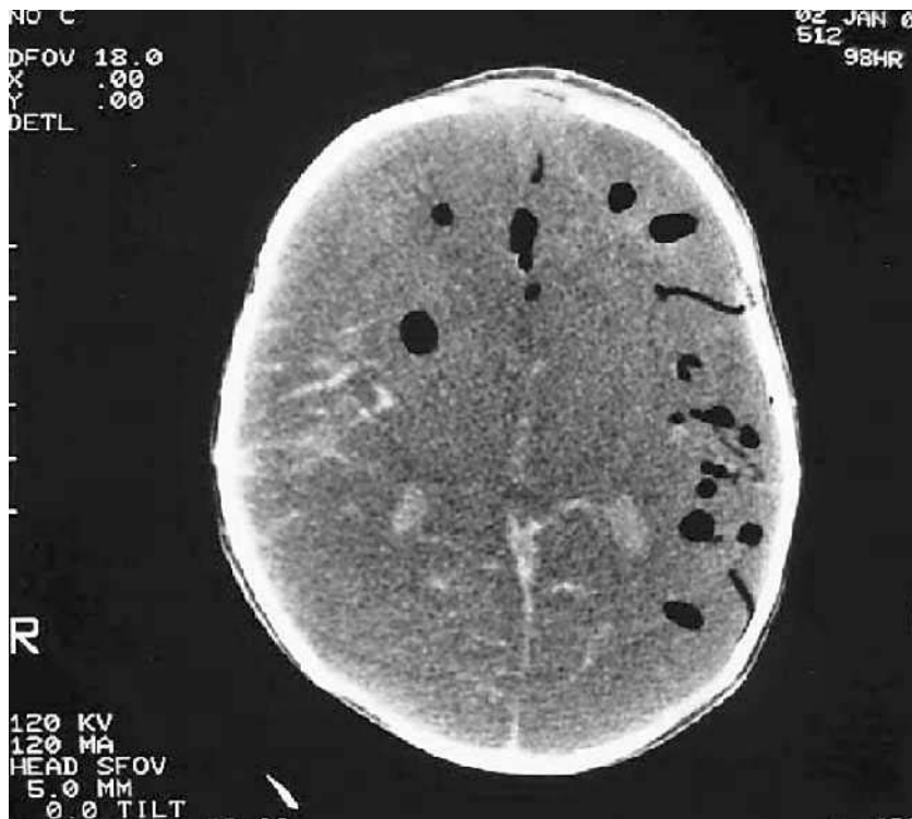
Figure 1 Computed tomography scan of the brain of a 10 day old male infant showing diffuse pneumocephalus.

M R Sedaghatian P Ramachandran N Rashid Mafraq Hospital, PB 2951, Abu Dhabi, United Arab Emirates; sreza@emirates.net.ae