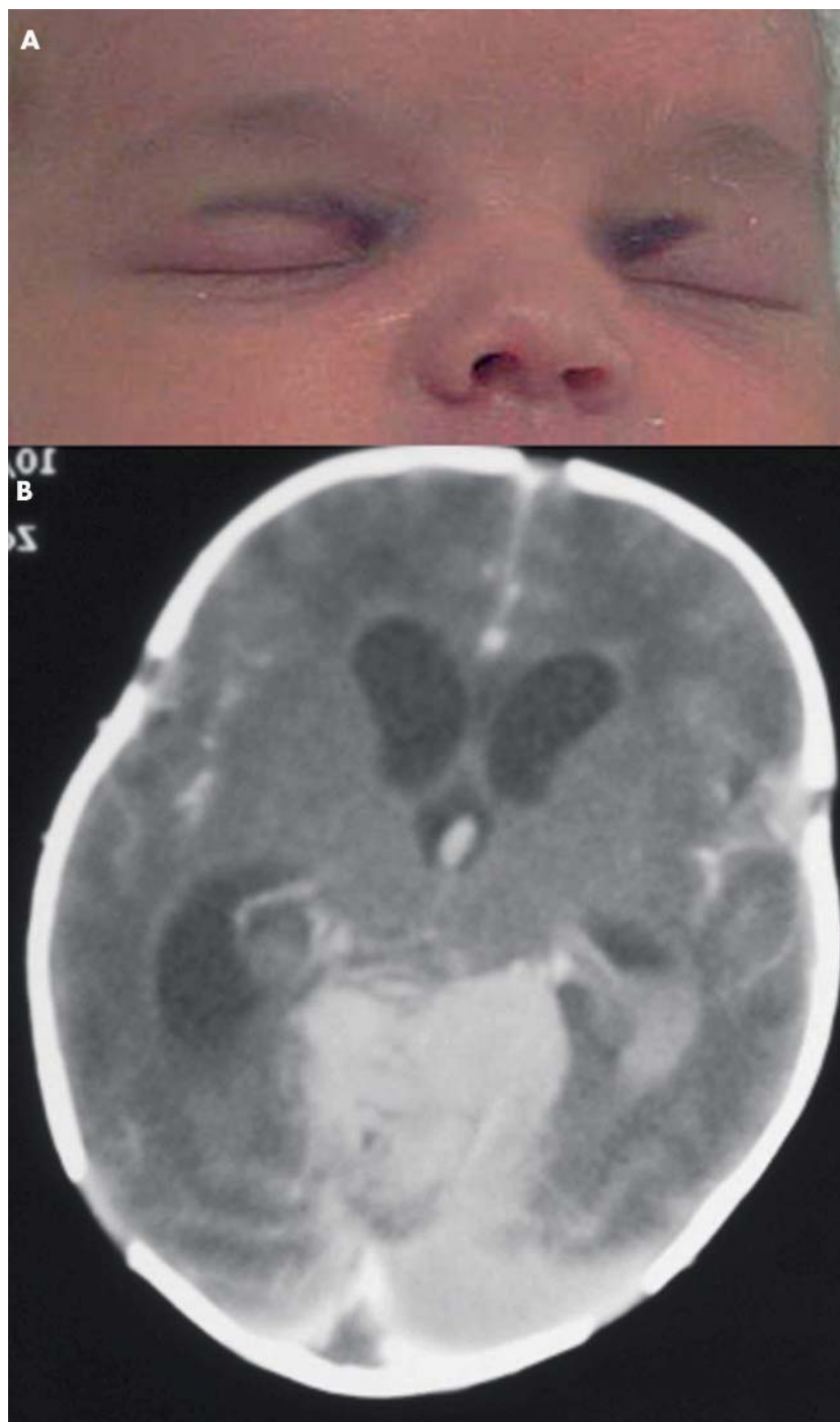
Figure 1 (A) Bilateral palpebral ecchymosis. (B) Computed tomography scan showing venous thrombosis ("empty delta sign" of torcular Herophili), posterior fossa bleeding, and ventriculomegaly.