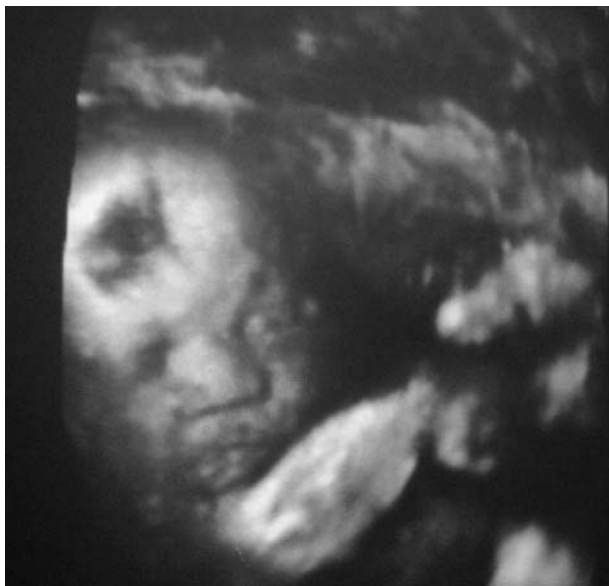
Figure 1 Skin tag-like lesions over left orbital region seen on three dimensional image at 28 weeks gestation.

Department of Pediatrics, Tri-Service General Hospital, Taipei, Taiwan, ROC