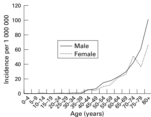
Figure 2 Average annual age specific eyelid cancer incidence among Singapore residents from 1969 to 1995.

Figure 2 presents the average annual age specific eye cancer incidence by sex among Singapore residents from 1968 to 1995. As seen in the graph, the incidence of eyelid cancers rises with age in both males and females.