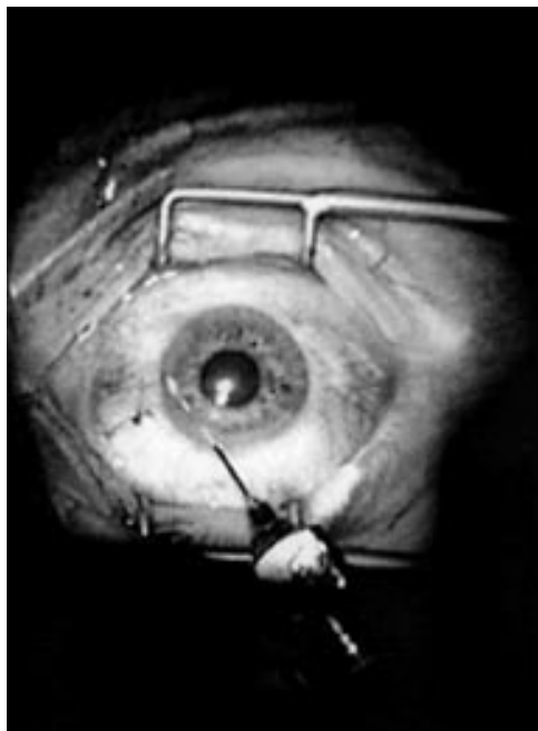
Figure 1 Cannula placed in the anterior chamber.

There was a strong correlation between these two methods ( r^2=0.866 ; p<0.0001 ). The mean of the two methods was calculated and used as applanatory IOP (IOPappl) for further statistics.