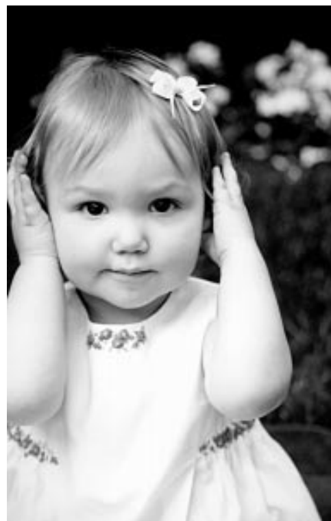
Figure 1 This is my patient who had a dense congenital cataract, left eye, identified at 1 day of age and had urgent surgery 48 hours after birth. The patient was treated aggressively with bilateral light occlusion from day 1 when the cataract was identified, until a contact lens was fitted at 1 week of age. The patient wears a contact lens full time, left eye, and the right eye is being patched 4 hours a day. As pictured above, the patient is now 1 year old, has excellent fixation in each eye, straight eyes, and the family is very happy that aggressive treatment was initiated.

When an older child presents with a unilateral cataract it can be difficult to know whether the cataract was there during the critical period and, if so, to what extent the cataract interfered with visual development. Often, the clinician is unsure whether it is worthwhile removing the cataract in a child who presents late after the critical period of visual development. Should we be aggressive in treating these children who present late with presumed unilateral congenital cataracts? This time the answer is sometimes. Kushner 13 reported relatively good results after surgery for monocular juvenile cataracts of undetermined onset. In the study of Wright et al 4 all patients presented after 10 months of age and were treated with lensectomy and aphakic contact lenses. Eighteen patients underwent surgery for a unilateral cataract and, of these, approximately 40% obtained a visual acuity of 20/60 or better. Unilateral cataracts having an especially good