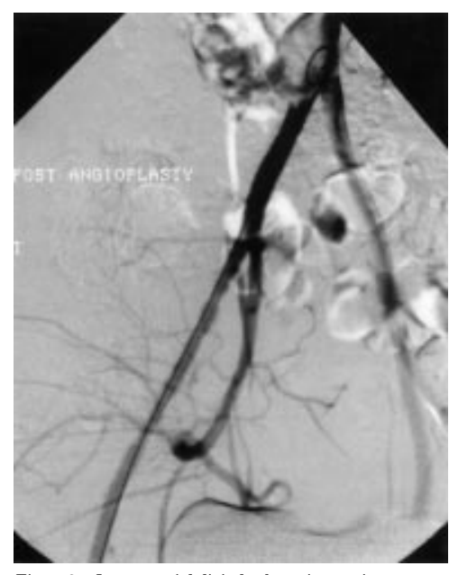
Figure 2 Intra-arterial digital subtraction angiogram after angioplasty.

index in the right leg fell from 1.18 at rest to 0.55 immediately after vigorous cycling effort. A lower limb arterial duplex scan was performed which showed no evidence of a significant stenosis in the right external iliac artery. Intra-arterial digital subtraction angiography was then undertaken, with views in both the anteroposterior and left anterior oblique projections (fig 1). These confirmed the beaded stenotic appearance compatible with endofibrosis. Intra-arterial pressure gradients across the right external iliac artery were normal at rest but increased to 28 mm Hg after vasodilatation with 25 mg intra-arterial tolazoline. Proximity to the Olympic cycling heats would not permit surgical intervention without significant interruption to training. Therefore balloon angioplasty of the diseased segment was performed with a 7 mm \times 4 mm balloon inflated to 10 atmospheres for one minute. The film after angioplasty (fig 2) shows little change in vessel calibre, but there was symptomatic improvement without a fall in the ankle brachial pressure index after exercise.