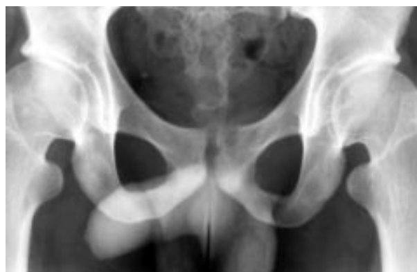
Figure 2 Radiograph of the os pubis showing an unclear lining of the symphysis pubis and bony destruction. Normal anatomy, no diastasis.