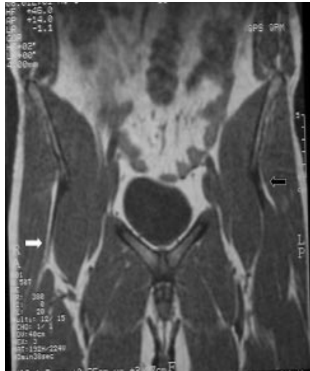
Figure 1 Magnetic resonance image of the thigh showing a normal rectus femoris tendon and muscle on the left (white arrow) and the proximal muscle avulsion on the right (black arrow) with a normal tendon still attached to the anterior inferior iliac spine and a very distally retracted muscle belly.

Surgical reattachment was performed. Through a 20 cm longitudinal incision, the muscle belly of the rectus femoris was fully mobilised. The muscle belly was embedded in a moderate amount of scar tissue. The proximal tendon, however, was surrounded by a dense mass of scar tissue. The tendon of the direct head was freed and traced back to its origin, the anterior inferior iliac spine, where the attachment was found to be normal. The muscle belly was brought proximally as far as possible (about 12 cm). The surrounding scar tissue