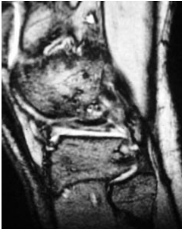
Figure 1 T1 weighted sagittal magnetic resonance scan showing attenuation of the proximal attachment of the popliteus.

Physical examination showed considerable tenderness on the lateral joint line and posterolateral corner of the knee. He had a grade I effusion in the knee with pain in the terminal ranges of movement. The knee was stable to varus and valgus stress in extension and varying degrees of flexion, and there