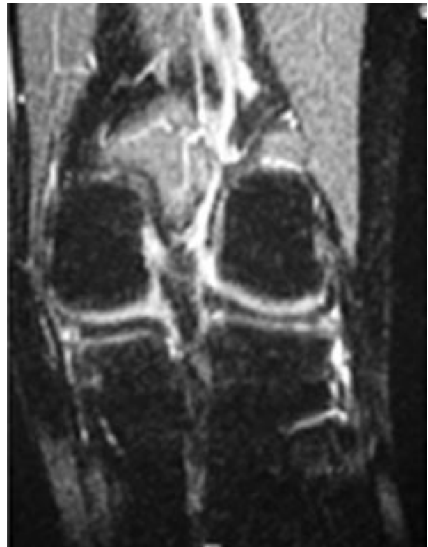
Figure 2 STIR sequence coronal scan showing irregularity of the popliteus tendon with surrounding oedema of high signal intensity.