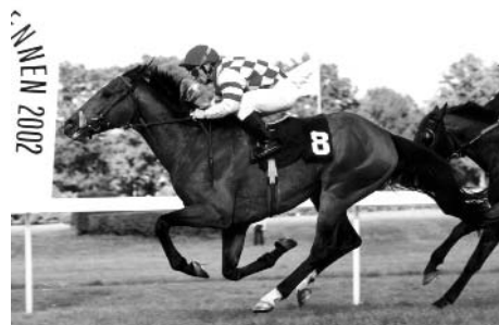
Figure 6 Photograph showing a jockey 3 months after intramedullary nailing of a midclavicular fracture in a contest.

There is some dispute about indications for surgery for fractures of the middle third of the clavicle. However, in the past, indications have been set very cautiously. 17 Internal fixation using plates is the standard surgical procedure. 18 The typical problems with this technique are: common hypertrophic or keloid scars, 19 implant loosening, 20–21 non-union, 22 and re-fracture after implant removal. 20–22 Different modifications of K wire or nail fixation of the clavicle have been reported. 23–27 In general, operative techniques have not been widely used to date because complication rates are higher than with conservative treatment. 28 One problem encountered has been migration of the intramedullary implants. 29 According to Schwarz and Leixnering, 30 however, unsatisfactory results after intramedullary procedures are caused either by the use of wires that are insufficiently strong or long, or by inadequate reduction of the fracture.