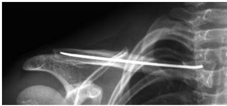
Figure 3 Radiograph obtained four months after surgery showing no implant displacement. The fracture is healed.

(06-A3), and five oblique (06-A2) fractures. In addition to the fractured clavicle, one cyclist had a minor head injury.