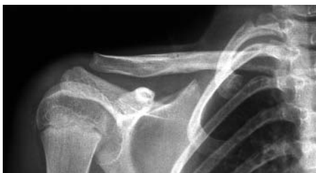
Figure 4 Radiograph obtained after hardware removal and five months after operation showing that there is no excessive callus formation and the shape of a normal clavicle is restored.

Twelve months after implant removal, the mean (SD) measure on the Constant score was 98.3 (2) points (range 95–100, median 99). For the total cohort of 80 patients, the Constant score averaged 96.2 (5) points.