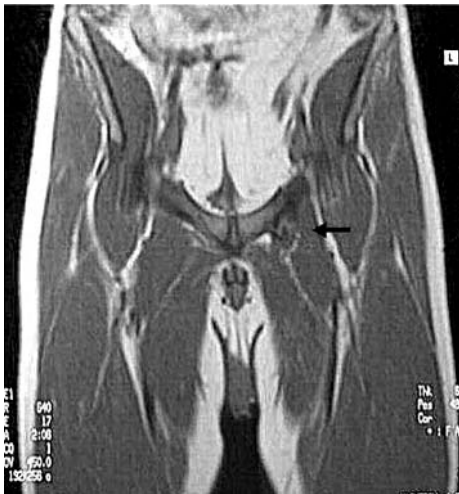
Figure 3 T1 weighted coronal magnetic resonance image showing that bone fragments have a cortex and medullae, close to the pubic ramus and within the soft tissue. This lesion looks like bone fragmentation, but there is no fracture or cortical defect in the pubic ramus.