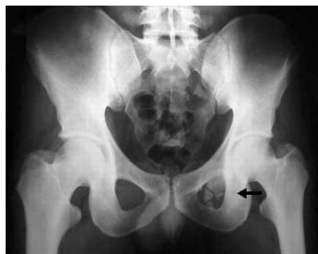
Figure 1 Pelvic radiogram showing mature bone fragments in the foramen obturatorium.

Isokinetic measurements of the adductor muscles of the involved hip joint at 120°/s angular speed at the baseline examination detected a deficit of 49% compared with the contralateral side. This deficit had decreased to 15% after three months of treatment (Cybex NORM Isokinetic Test Device, Blue Sky Software Corp, New York, USA). In addition, the athlete was able to do sport specific activities such as running figure of eights, shuttle runs, cariocas, and kicking without any symptoms.