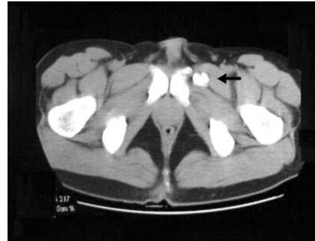
Figure 4 Computed tomography scan showing that the bone fragments were not connected to the pubic ramus but have an intramuscular (adductor brevis) localisation.

Myositis ossificans in the adductor muscles is a rare cause of chronic groin pain in soccer players. No other cases have been reported, but two cases have been reported in the iliopsoas muscle.