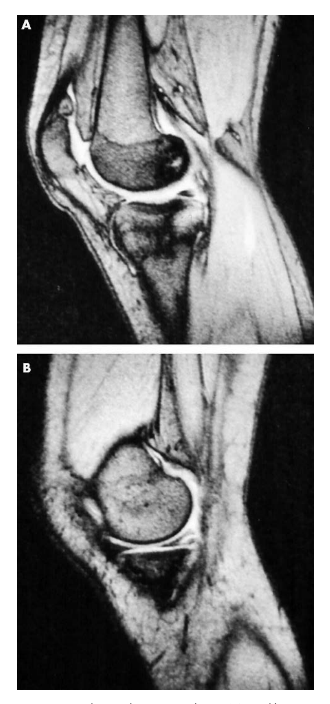
Figure 1 Sagittal proton density images showing (A) typical kissing contusion with bone bruise areas of low density signal in the medial femoral condyle and the posterior lip of the medial tibial plateau. (B) Note the menisceal tear.

A menisceal tear was diagnosed on proton density images or, best, on T2 weighted sequences, when the images typically showed a disruption of the triangular low intensity signal as an irregular high intensity signal (vertical or horizontal)