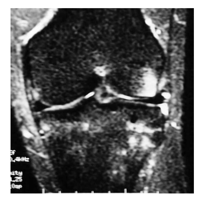
Figure 2 Coronal FSE inversion recovery image, showing kissing contusion in the lateral compartment as areas of high intensity signal. The surrounding medullary bone (fatty marrow) is suppressed and appears as low density (null) signal.

lesion of the lateral collateral ligament. In four of the cases (table 2, cases 4, 5, 12, and 13), the bone contusion was located on the terminal sulcus on the lateral femoral condyle (type I and type II) and on the posterolateral tibial condyle (type III). In three cases (table 2, cases 14, 15, and 16), the bone contusion was located on the lateral femoral condyle (type I and type II) and on the posterior lip of the medial tibial condyle (type III). One case (table 2, case 6) involved the medial compartment, with a type I lesion on the medial femoral condyle and on the posterior lip of the medial tibial condyle.