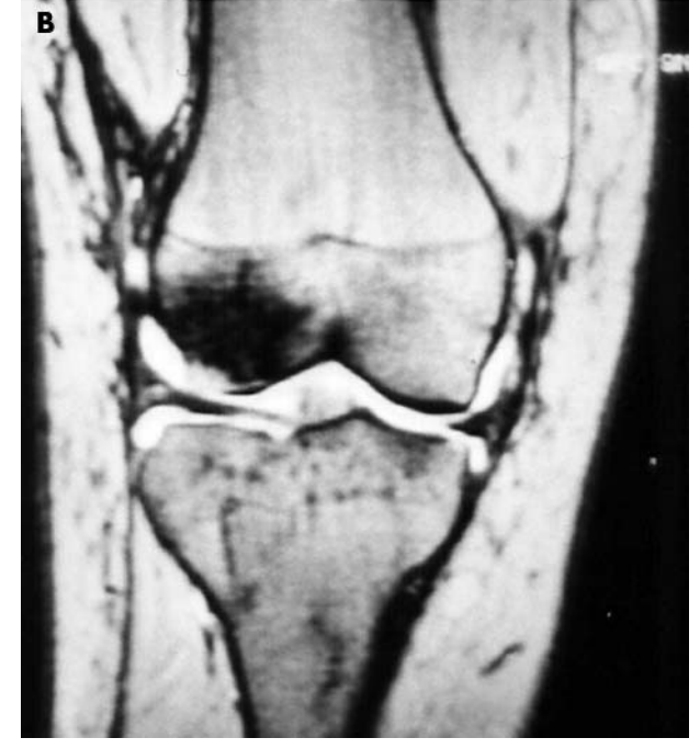
Figure 3 Coronal proton density images showing the kissing contusion low density signal areas (arrows) on the lateral femoral condyle (A). A more posterior section (B) shows the contusion on the lateral tibial condyle.

bone contusion on the lateral femoral condyle was still detectable but was more diffuse than on the initial MRI.