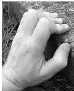
Figure 3 The cling grip.

Many climbers use a number of standard handholds, although other less conventional holds are often applied. Handholds in rock climbing generate large forces in the flexor digitorum profundus and superficialis tendons and the