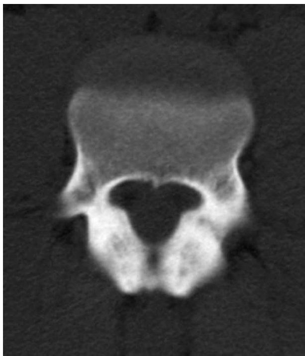
Figure 1 Reverse gantry computerised tomogram of L4 in an 18 year old cricketer, a fast bowler who uses his right arm to bowl, showing an incomplete fracture in the left pars interarticularis.

between cricket players and soccer players (difference 37.5%; 95% CI 0.02 to 0.65). Complete fractures identified on rg-CT are presented in table 4. The difference between the percentage of sites of complete fractures on left and right sides between cricket players and soccer players did not reach