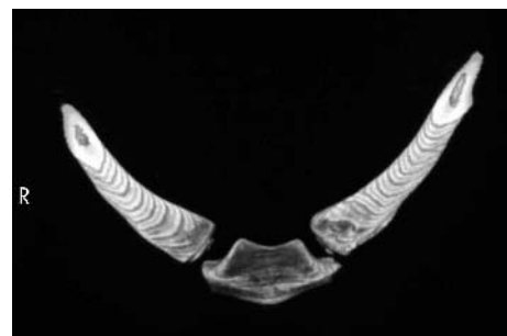
Figure 4 3D reconstruction view at 8 month follow up appointment. The joint reduction is stable.

differ and reduction is advised in all cases. This should be by closed means if at all possible, and the stability of the reduction should be assessed. If closed reduction is impossible or if the joint is unstable, then an open reduction is advised.