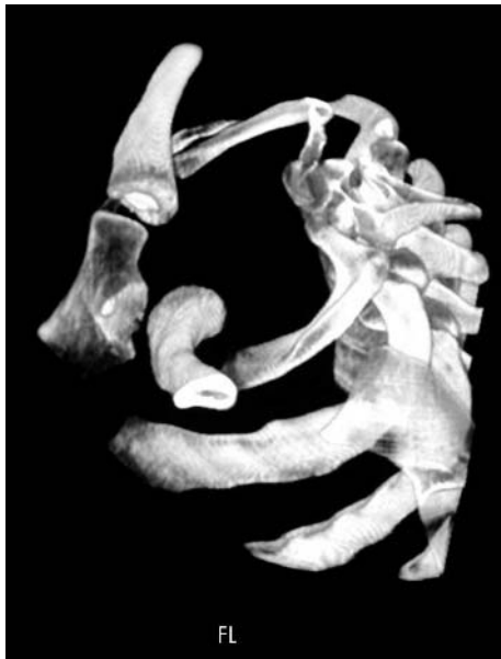
Figure 1 3D reconstruction view clearly showing dislocation.

include the “serendipity” (cephalo-caudal) view. Successful use of ultrasound scanning has been reported although this requires operator experience. 4