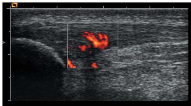
Figure 2 Longitudinal scan of the patellar tendon. The hypochoic region and neovascularisation is seen in the marked area. PD signals indicate flow inside the tendon and its immediate surroundings.

Jumper's knee is a common problem among senior volleyball players. 9 This investigation shows that jumper's knee is already relatively common (14%) among high level volleyball players at a relatively young age. This is higher than the 7% Cook et al reported in a group of male and female basketball players (14-18 years of age), 2 but lower than the 36% reported by Lian et al in a group of 47 male senior professional volleyball players. 27