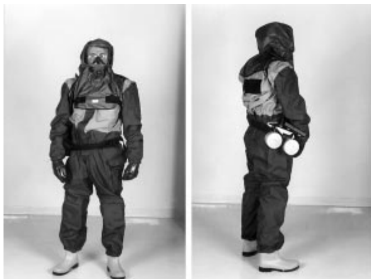
Figure 1 TST-Sweden chemical protection suit.

could be carried out safely and effectively while wearing the chemical protection suits that are available in the department.