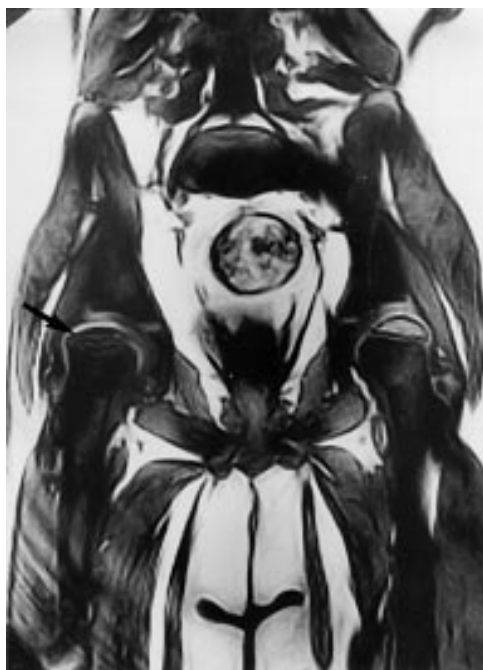
Figure 1 Gradient echo T1 weighted coronal image. Established avascular necrosis of the right femoral capital epiphysis (arrow head) with slight flattening of the left proximal femoral epiphysis.